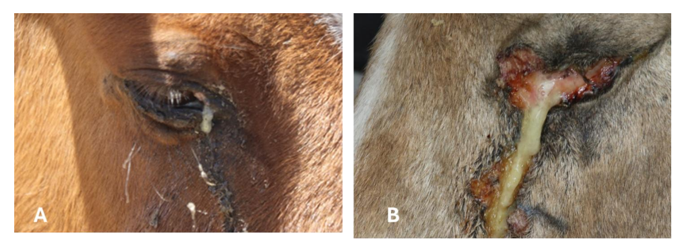
Figure 2: Ocular form of equine epizootic lymphangitis (EEL); A) Occular discharges, B) Severely affected eyes, resulting in eye loss.

Flies are essential in transmitting the fungus to other parts of the animal or equid. The flies are such a nuisance that infected horses are often found in the middle of the road. The wind created by passing vehicles relieves them from this pest. Singh (1965) showed that the average horse flies, Musca and Stomoxys spp., could carry HCF in their digestive tract for 20 days and then transmit the disease. Ameni and Terefe (2004) believe that the tick Boophilus may also play a role.