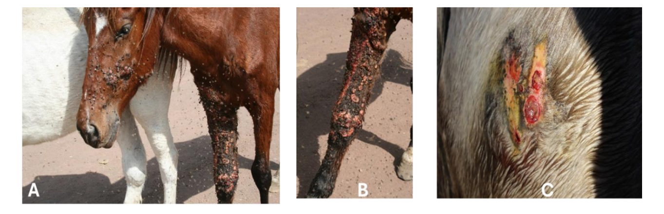
Figure 1: Clinical forms of equine epizootic lymphangitis (EEL). A) Chronic severe case of EEL showing skin lesions on the face and front limbs surrounded by innumerable flies, Musca ssp. B) EEL of an Ethiopian horse in Debre Zeit showing severe multiple ulcerated nodules on the right front leg. C) Skin ulceration caused by EEL.

Cutaneous EEL is the most common and widely reported form, characterized by subcutaneous, freely transferrable nodules originating from infected superficial lymph nodes that progress along the lymphatic system. These alterations of the lymph nodes, skin, and lymphatic vessels are described by Buxton and Fraser (1977). The lesions develop within weeks up to 3 months to form. Nodules may appear in any body part, mainly in the lower limbs, neck, chest, and face (Figure 1). First, an intradermal swelling can be developed into a small lump, followed by several nodules along the lymphatics. These nodules rupture and discharge a thick pus, leaving ulcerated skin lesions. This process frequently undergoes alternating periods of discharge and ulceration. The skin covering these ulcers becomes thick and fuses with the subcutaneous tissues (Figure 1).